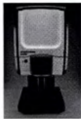
2 Spectrophotometer Data color 800V