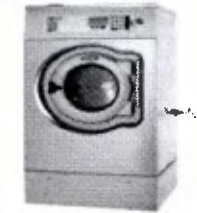
1. Reference WM Wascator FOM 71 CLS / Electrolux