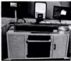
4. Fixture for test Swatches on Data color

Budget Details: WM QA Investment Budget 2018 (Activity Code-DFZ18ME000017) - 39 Lacs. WM R&D Investment Budget 2018 (Activity Code-DFZ18TL000061) - 25 Lacs.