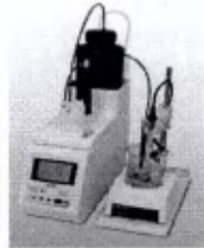
3. Potentiometric Titrator TP-70/Toadkk