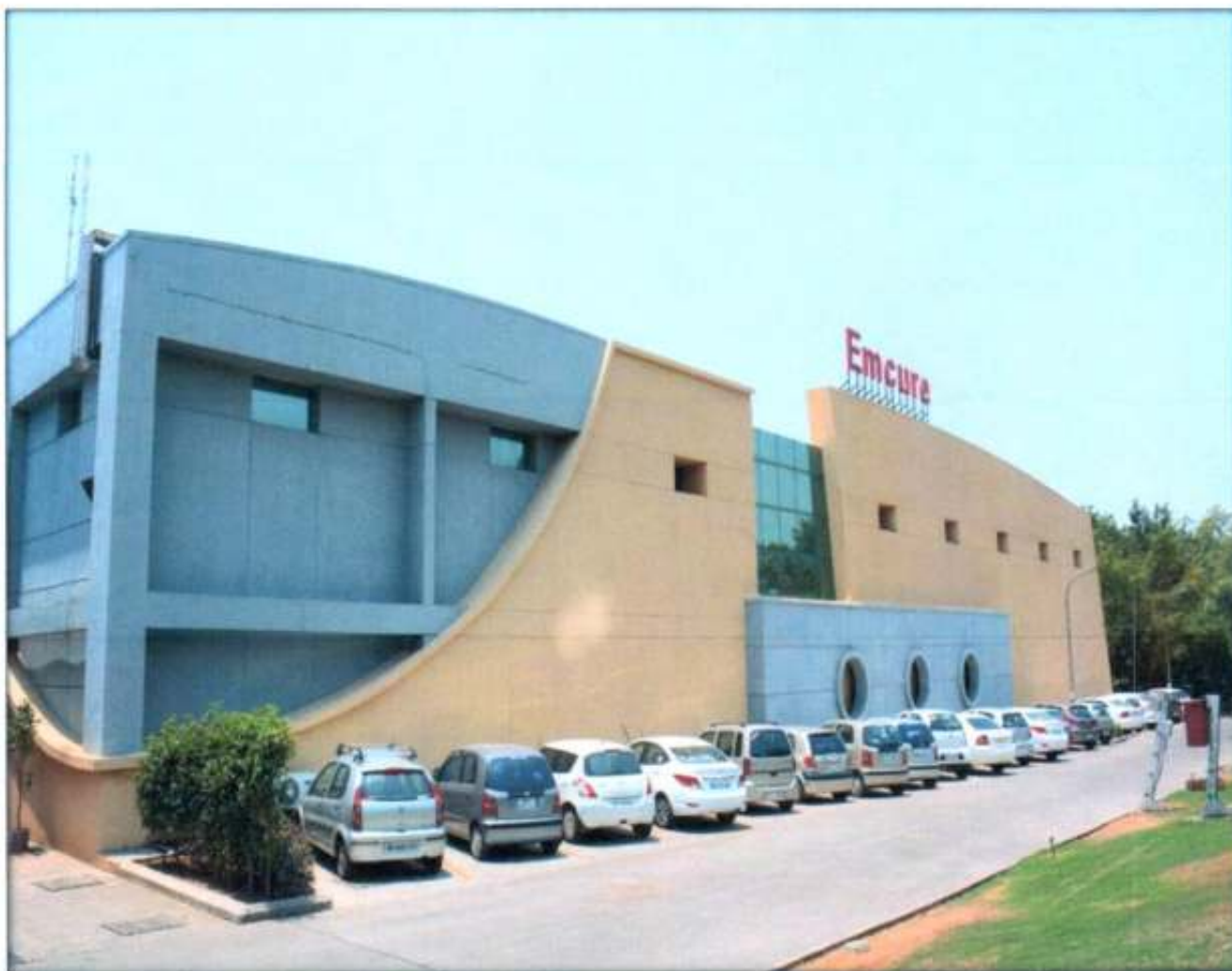
Snapshot of the Asset/ Property Under Valuation