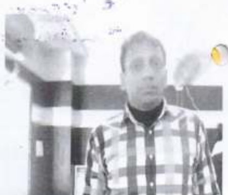
उप / सयुक्त पैजीयन अधिकारी