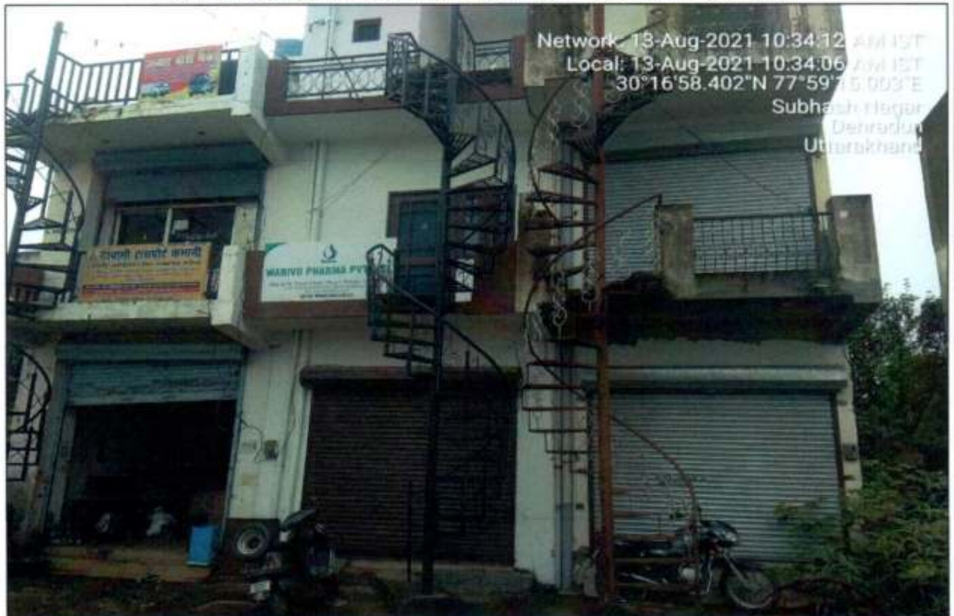
Snapshot of the Asset/ Property Under Valuation