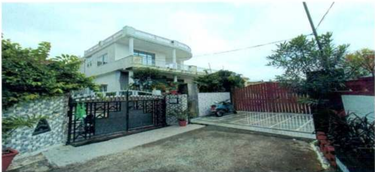
Snapshot of the Asset/ Property Under Valuation

This opinion on valuation report is prepared for the residential independent house having total land area admeasuring 360 sq. mtr. (430.50 sq. yds.) and covered area 225 sq. mtr. (2421.8 sq. ft) as