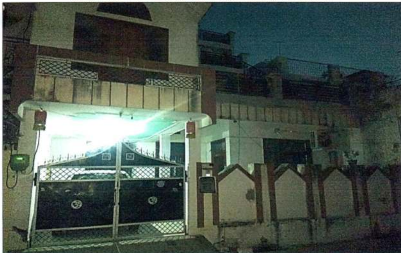
Snapshot of the Asset/ Property Under Valuation