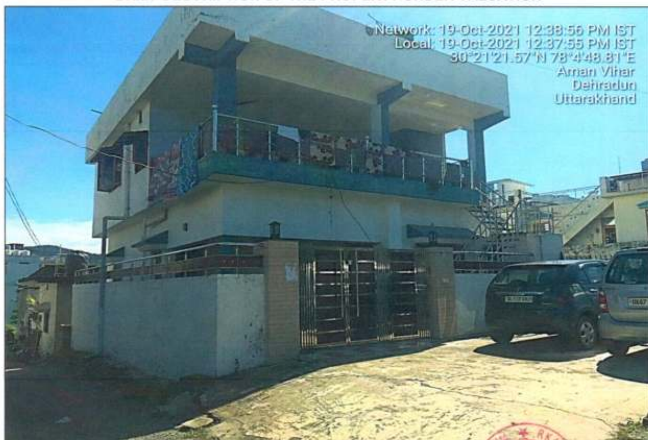
Snapshot of the Asset/ Property Under Valuation