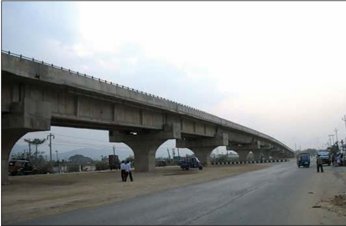
Widening & Strengthening of existing National Highway from 2 lane to 4 lane of Sonapur to Guwahati section of NH-115 (earlier NH 37) for NHAI.

at every level. Our HSE Policy ensures that site operations meet legal requirements and that operations cause minimal visual impact or nuisance to the public. Continuous efforts to achieve safety awareness and eliminate unsafe practices are made through employee engagement.