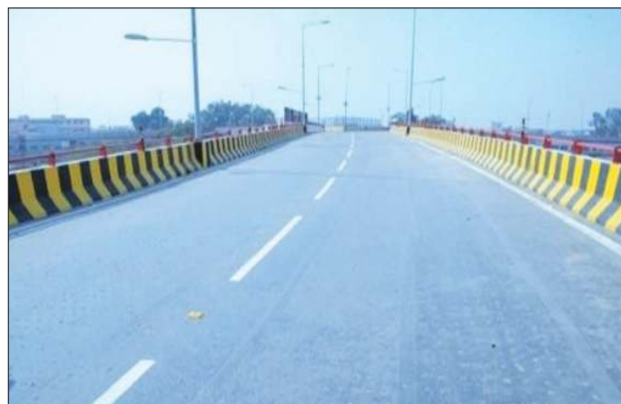
Construction of 2 lane Railway overbridge at Sonapat for Haryana State Roads and Bridges Development Corporation Ltd.