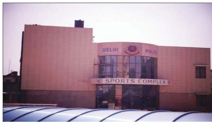
Police Station & Residential Quarters at Kondli, New Delhi for MHA, Delhi Police through RITES Ltd.