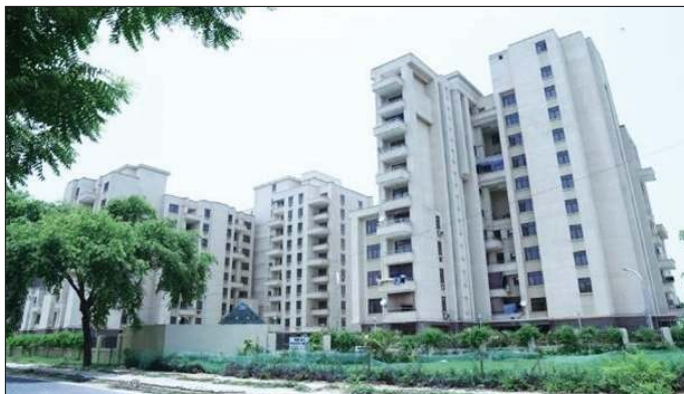
Residential accommodation for NHAI staff at Sector 17, Dwarka, New Delhi.

The Government, through a series of initiatives, is working on policies to attract significant investor interest. A total of 200,000 km of national highways is expected to be completed by 2022. In the next five years, National Highway Authority of India (NHAI) will be able to generate Rs. 1 lakh crore annually from toll and other sources.