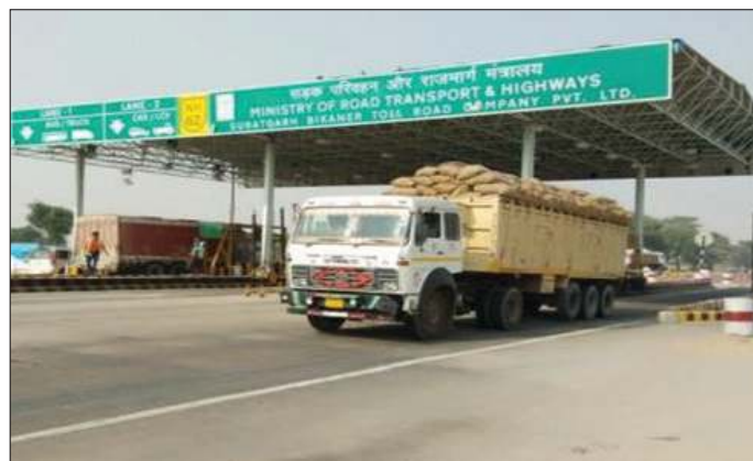
Development and Operation Bikaner-Suratgarh Section of NH-62 (earlier NH-15) in the State of Rajasthan).

We have an adequate system of internal control to ensure that transactions are properly authorized, recorded, and reported apart from safeguarding our assets. The internal control system is supplemented by well-documented policies, guidelines and procedures. We have also installed an extensive CCTV Surveillance system to cover all our project sites. All these measures are continuously reviewed and necessary improvements are implemented.