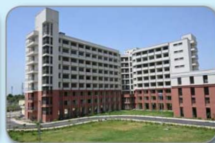
Construction of National Law University, Rai in Sonapat District, Haryana for PWD (B & R), Haryana.