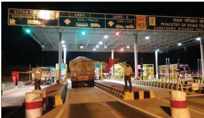
Development & Operation of Bikaner-Suratgarh Section of NH-62 (earlier NH-15) in the state of Rajasthan for Ministry of Road Transport & Highways through PWD, Rajasthan (PCOD-96.54%).

The Indian economy was expected to grow by 12-13% in 2021-22, primarily on the back of the contraction it saw in 2020-21. But with the second wave of the covid pandemic spreading across the country, the expected double-digit growth is now in peril. In light of the recent surge in COVID-19 cases, a strong control over the pandemic spread continues to be a necessary for broad-based economic recovery.