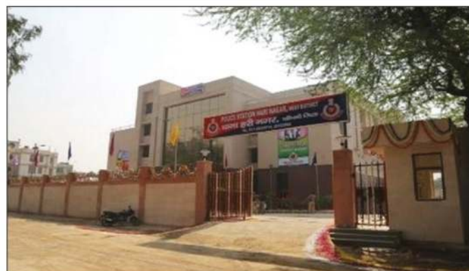
Construction of Police station & Residential Quarters, Hari Nagar, Delhi for MHA, Delhi Police through RITES Ltd.