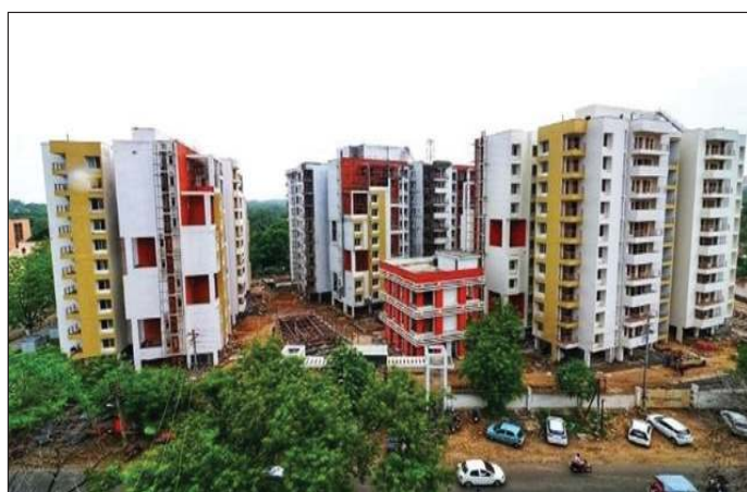
Construction of 222 Flats at Keelandev Tower, Bhopal for MP Housing & Infrastructure Development Board.