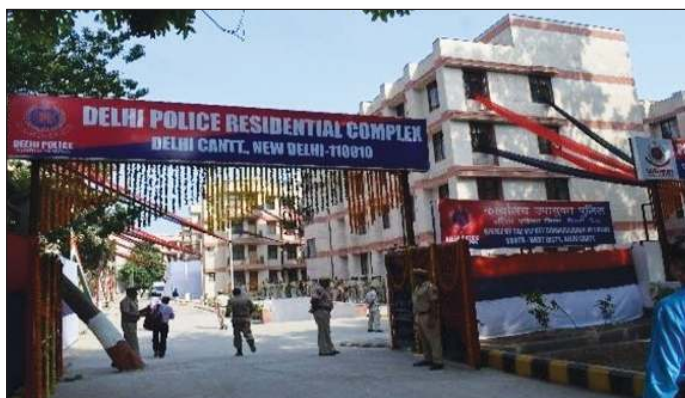
Police Station & Police Colony, Delhi Cantt. for MHA, Delhi Police through RITES Ltd.

National Highways Authority of India is mandated to implement National Highways Development Project (NHDP) which is India's largest ever Highways Project in a phased manner. National Highways have a total length of 72,000 (approx) km to serve as the arterial network of the country.