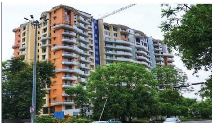
Construction of 96 flats at Tulsi Tower, Bhopal for MP Housing & Infrastructure Development Board.

concrete, quarrying & mining divisions which provide raw material security.