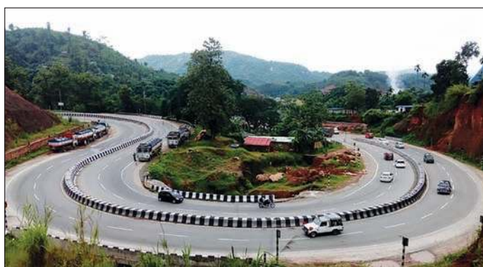
Widening & Strengthening of existing National Highway from 2 lane to 4 lane of Sonapur to Guwahati section of NH-115 (earlier NH 37).

Production-linked incentive (PLI) schemes for Rs.1.97 lakh crores, over 5 years starting from FY 2021-22 in ten key specific sectors to make Indian manufacturers globally competitive, attract investment in the areas of core competency and cutting-edge technology; ensure efficiencies; create economies of scale; enhance exports and 'Make in India' an integral part of the global supply chain. These Schemes provide incentive to enhance production and create wealth and jobs. India remained a preferred investment destination in FY 2020-21. FDI poured in amidst global asset shifts towards equities and prospects of quicker recovery in emerging economies. Combined with a rise in gold reserves and foreign currency assets, India's foreign exchange reserves climbed to a new high of US$ 586.08 billion during FY 2020-21.