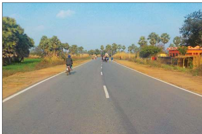
Improvement/Upgradation of roads and bridges of Shivganj-Rafiganj-Goh-Uphara-Devkund-Baidrabad Road (SH-68), Package 1 for Bihar State Road Development Corporation Ltd.