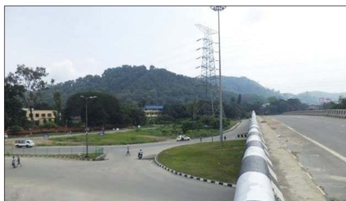
Widening & Strengthening of existing National Highway from 2 lane to 4 lane of Sonapur to Guwahati section of NH-115 (earlier NH 37) for NHAI.