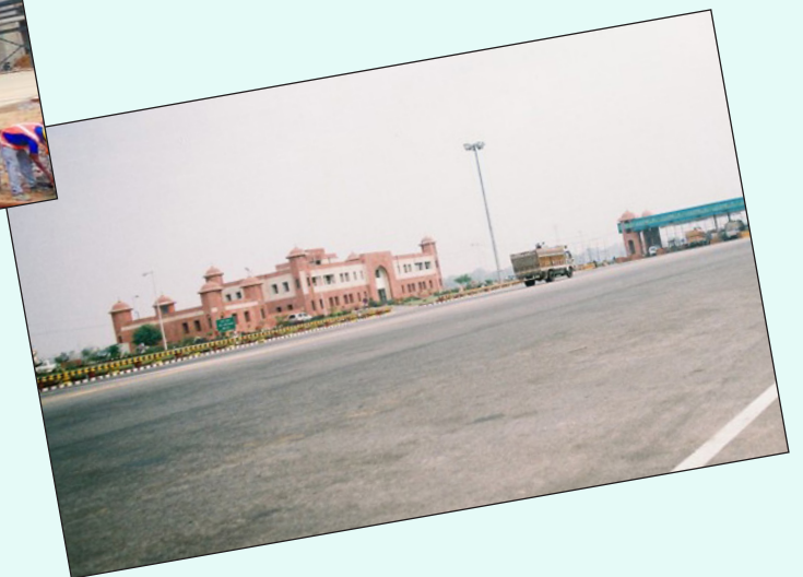
Some of completed projects