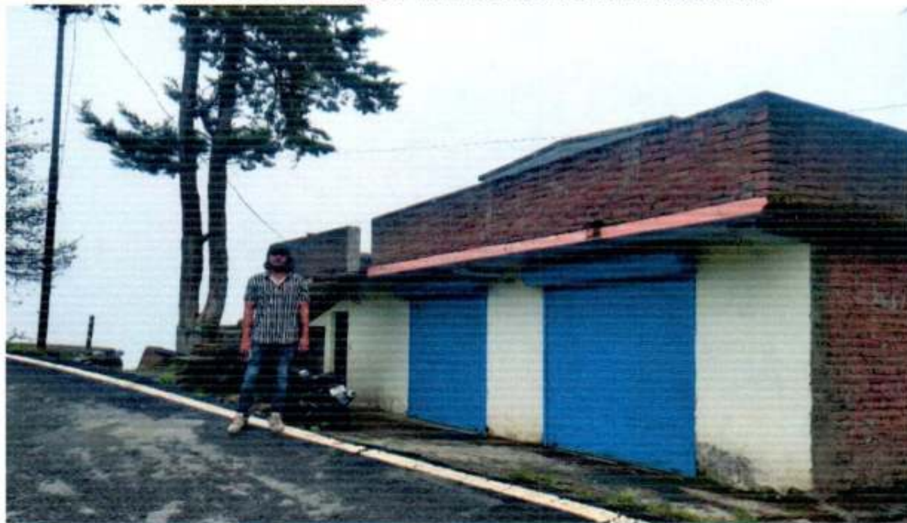
Snapshot of the Asset/ Property Under Valuation

The subject property is a residential property situated at aforesaid address having total land measuring