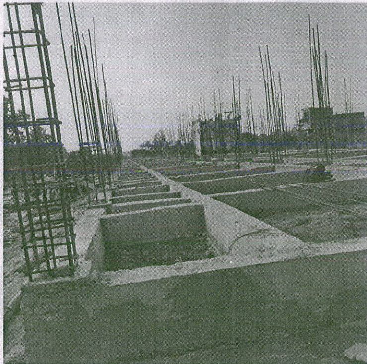
VIEW OF PLINTH BEAMS