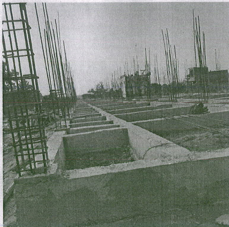
VIEW OF PLINTH BEAMS