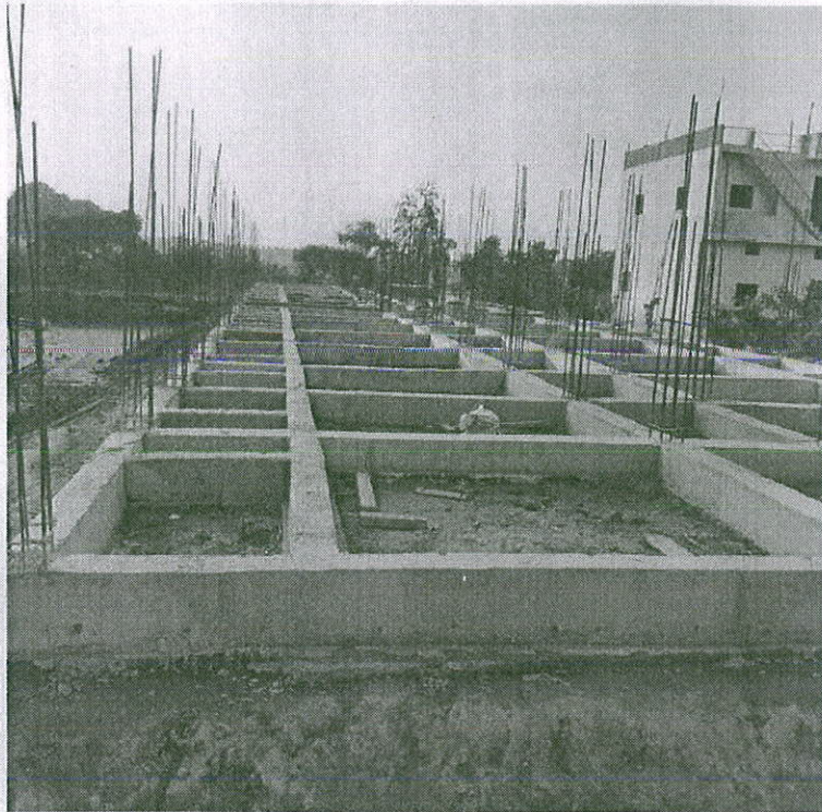
VIEW OF BLOCKS (PLINTH LEVEL CONSTRUCTION)