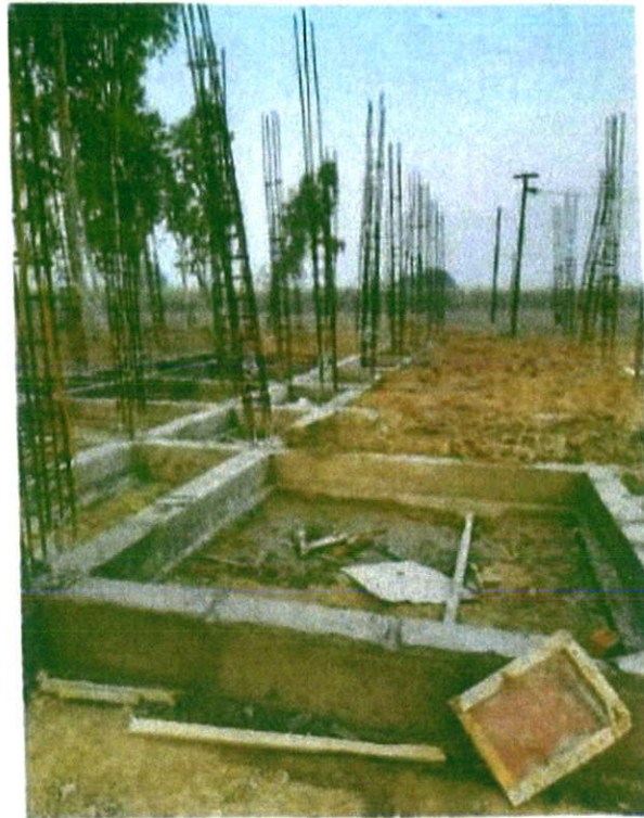
VIEW OF PLINTH BEAM