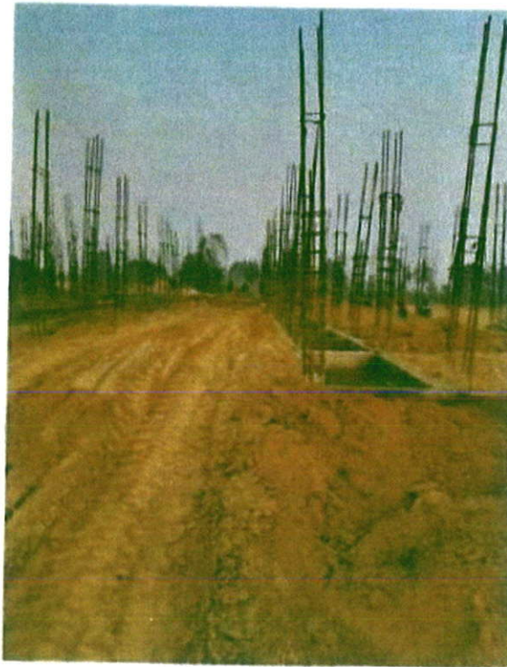
VIEW OF BLOCKS (PLINTH LEVEL CONSTRUCTION)