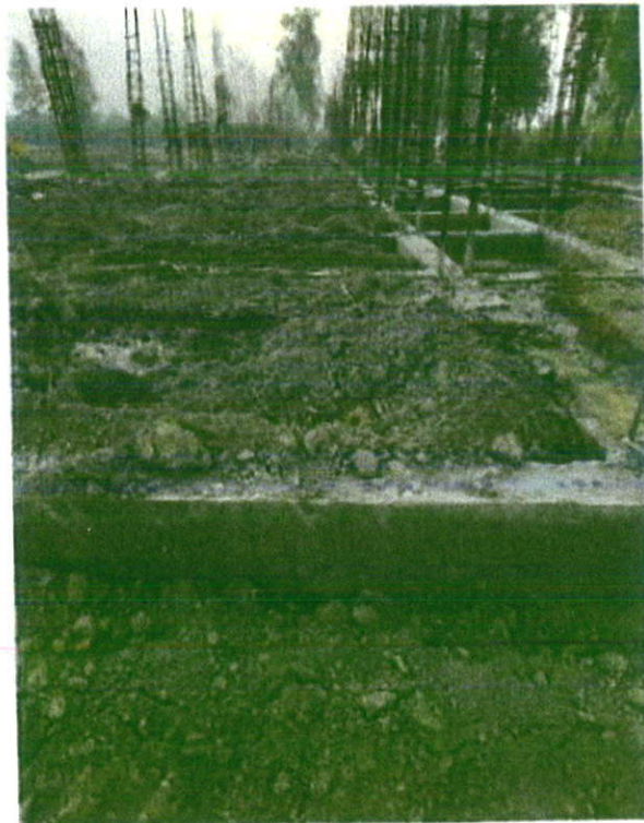
VIEW OF FILLING