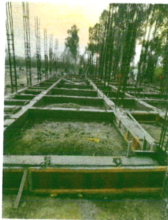
VIEW OF CASTING OF PLINTH BEAMS