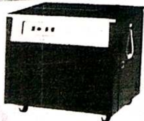
MODEL - STANDARD VP 201

Heavy Duty Model VP 501 is also available