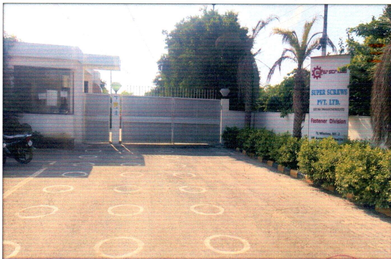
Snapshot of the Asset/ Property Under Valuation