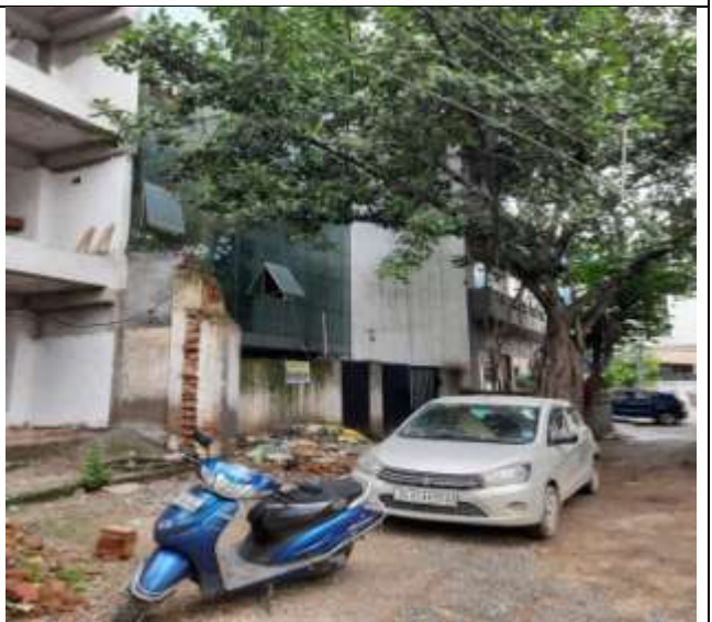
PHOTOGRAPHS OF INDUSTRIAL PREMISES NO. 34-B, SITUATED IN UDYOG VIHAR, PHASE-V, TEHSIL & DISTT. GURUGRAM