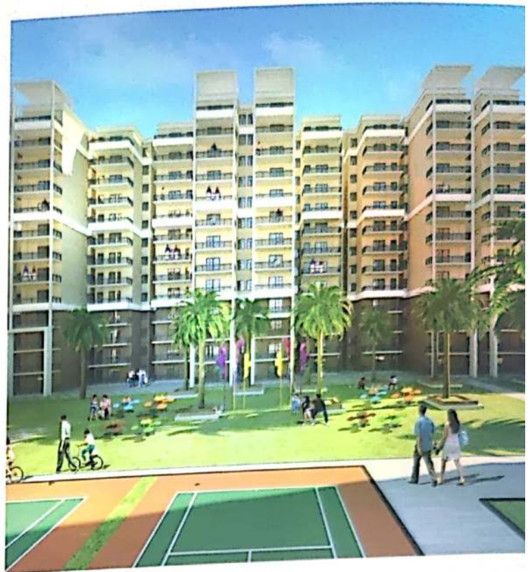
Supermax - The New Town Sector-33, Sonipat

Supermax Group provides the highest level of services with quality, commitment, integrity, excellence and exceptional values to all of its clients and partners without compromising on the trust factor. With an outstanding reputation within the investors and home buyers fraternity beyond Delhi NCR, Supermax Group develops every infrastructure with dedication and real ambition so that the future generations can utilize.