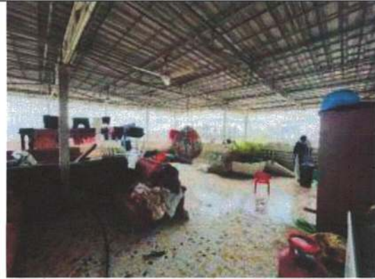
VIEW OF TERRACE