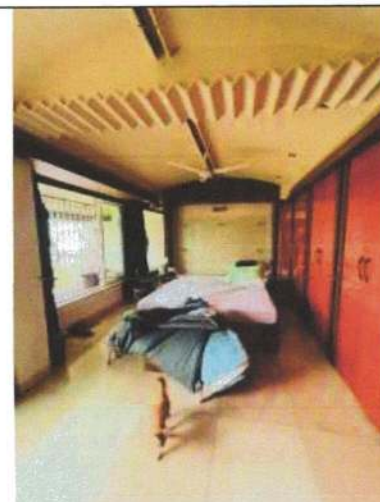
VIEW OF BEDROOM 1