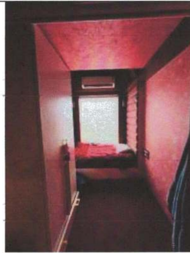
VIEW OF BEDROOM 2