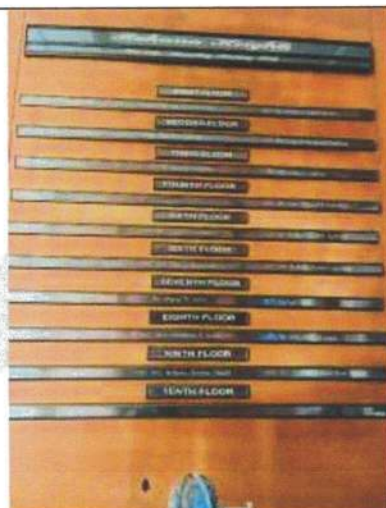
VIEW OF NAME BOARD