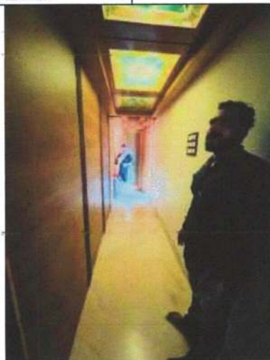
VIEW OF PASSAGE