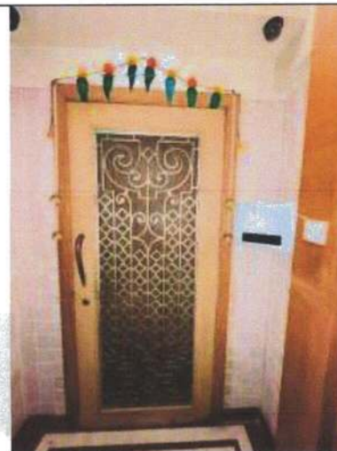
VIEW OF MAIN DOOR