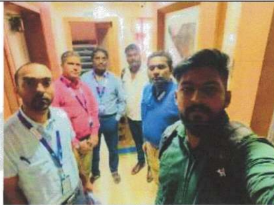
SELFIE AT SITE