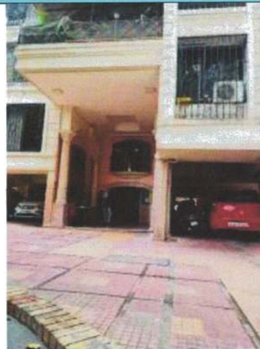
VIEW OF ENTRANCE OF BUILDING