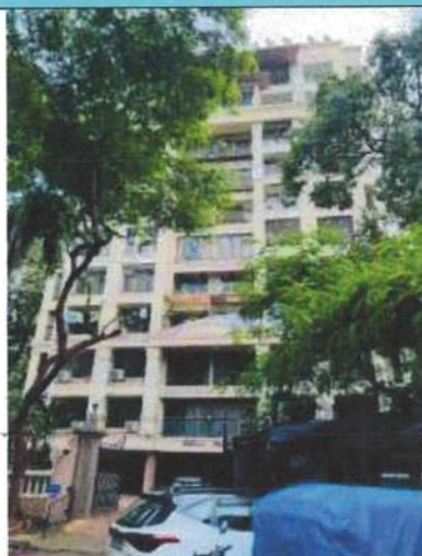
VIEW OF BUILDING