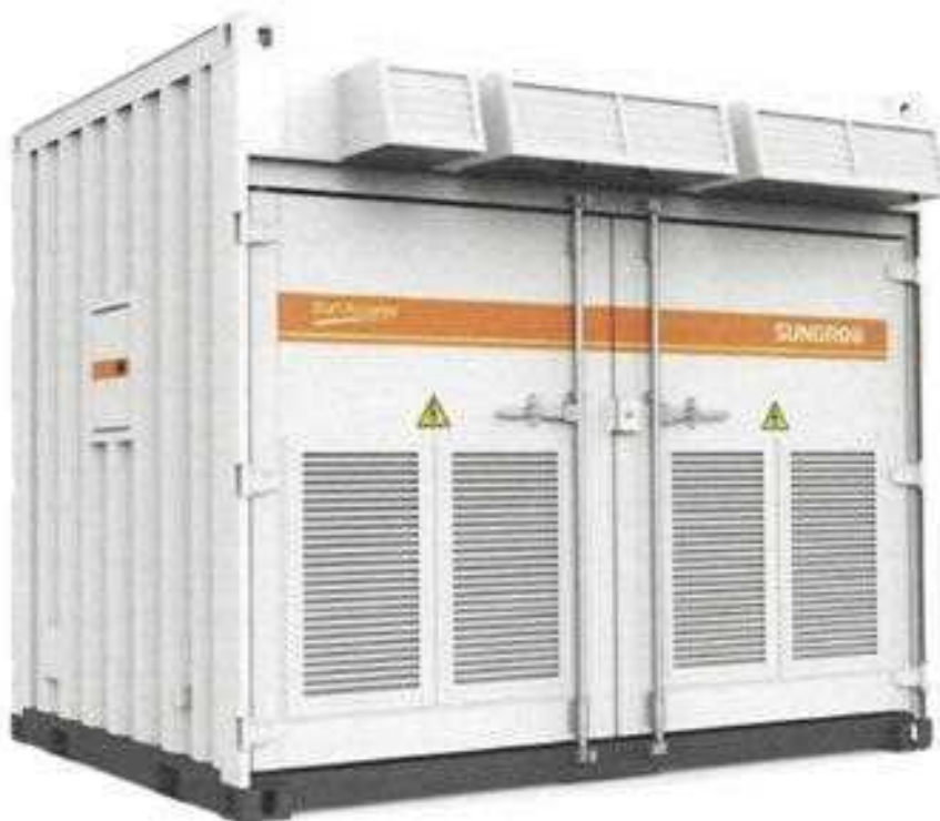
Figure 20: Illustrative image of the Central Inverter

The illustrative image of the Inverter is given below: