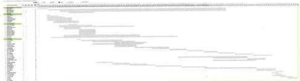
Figure 23: Project Management Schedule

Tentative solar photovoltaic Ground Mounted plant project schedule as per following image.